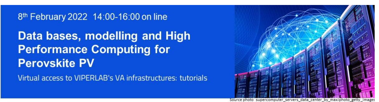
Figure 2. VIPERLAB online workshop organized in February 2022

On 8 February 2022, VIPERLAB organized a workshop on "Databases, Modelling and High-Performance Computing for Perovskite PV". The content of the workshop was divided in a short introduction on the VIPERLAB project and the presentation of the four virtual infrastructures proposed by the project. Read more <a href="here">here</a>.