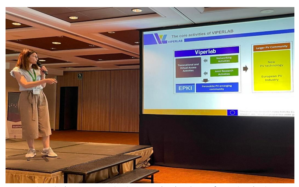
Figure 3. The VIPERLAB project is presented at the HOPV conference in Valencia.

On 23-25 May 2022, VIPERLAB attended the HOPV conference in Valencia (Spain) , A physical booth was installed to welcome and discuss with those attendees interested in the project. Read more here.