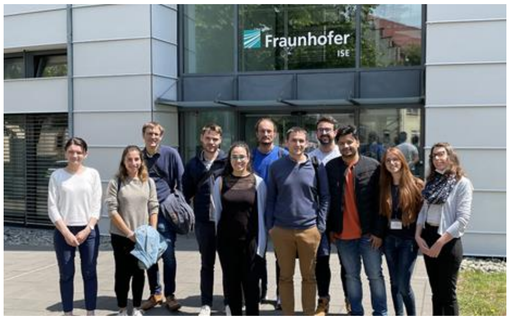
Figure 4. Participants at the first VIPERLAB physical workshop on Precise Measurements.