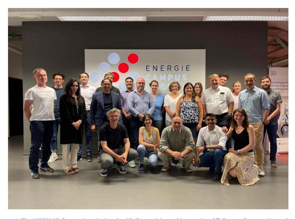
Figure 1. The VIPERLAB Consortium during the 1^{\rm st} General Assembly meeting (@ Energy Campus Nuremberg).