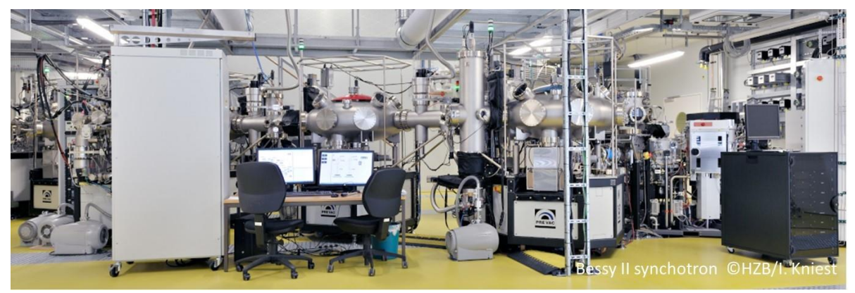
HZB-EMIL - Energy Materials In-Situ Laboratory Berlin one of the seventeen Research infrastructures offered by VIPRLAB (13 physical and 4 Virtual). More <u>information</u>.

It will facilitate faster and reliable technology evaluation cycles to enable a swift market entry for Perovskite-based PV products and hence a more wide-spread utilization of renewable energy conversion technology.