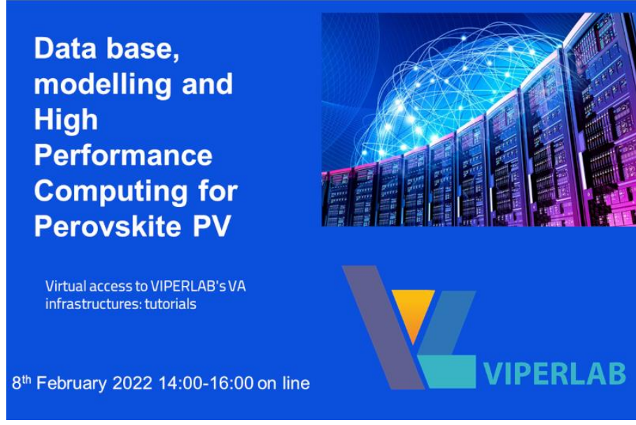
Upcoming on line workshop on the access to Viperlab Virtual Infrastructures: tutorial

The project has recently entered in its 6<sup>th</sup> month. This successful milestone was marked with the second executive board meeting on November 17<sup>th</sup>, 2021. The consortium continues to move full speed ahead to achieve its next goals.